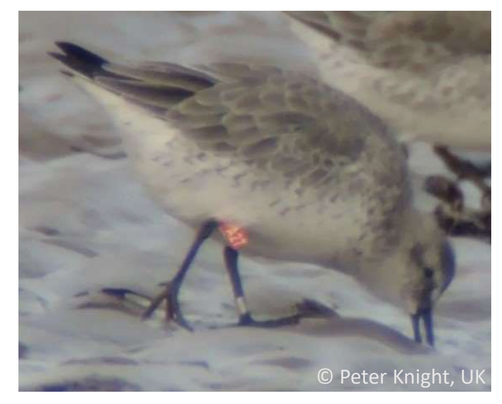
(Y+)Rf A27, November 2019, Ribble Estuary, UK