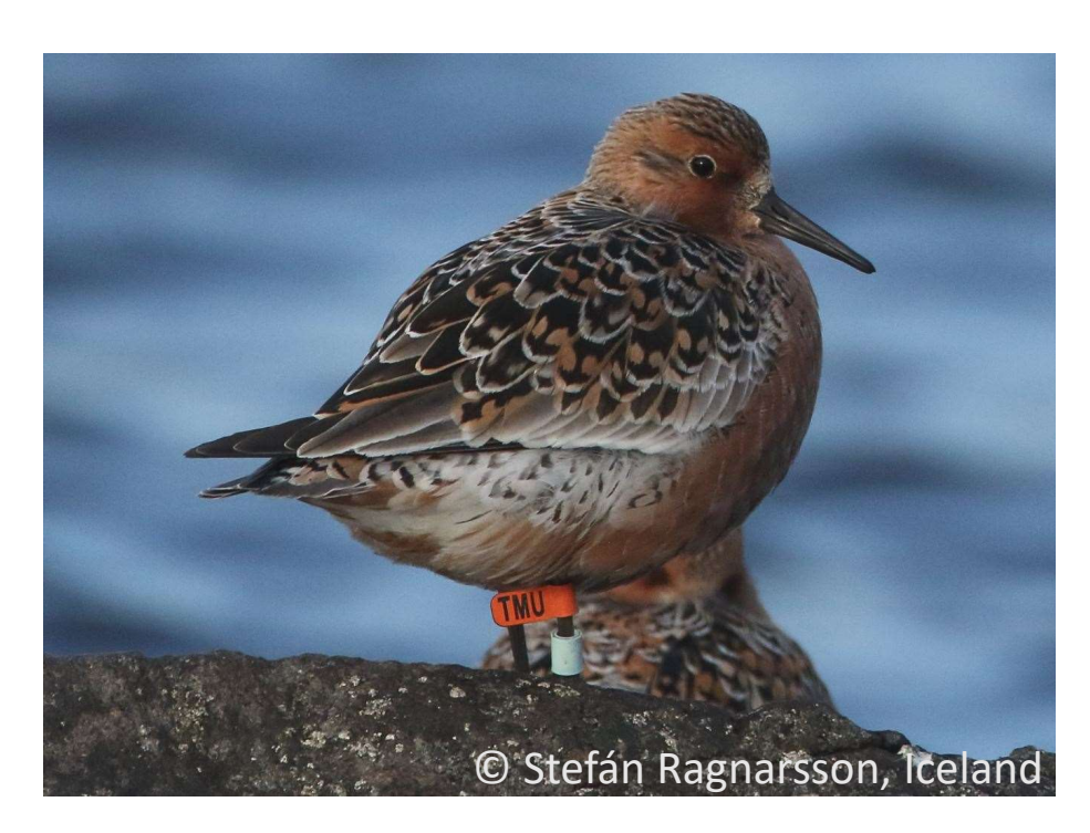
OfP TMU, May 2022, Reykjanesbær, Iceland