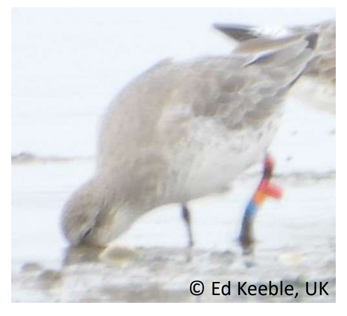
R-RfOB, Oct 2020, Stour Estuary, Essex, UK