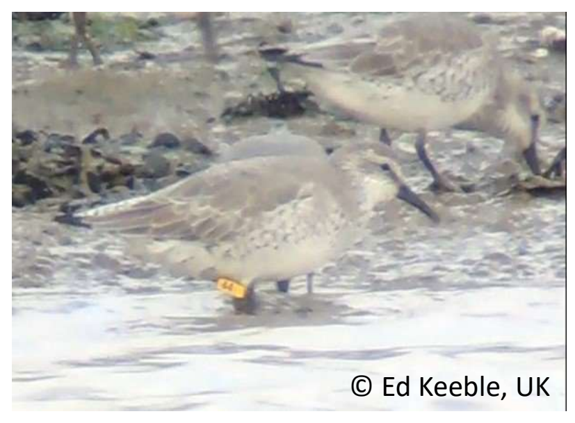
Yf 44, Stour Estuary, Essex, UK