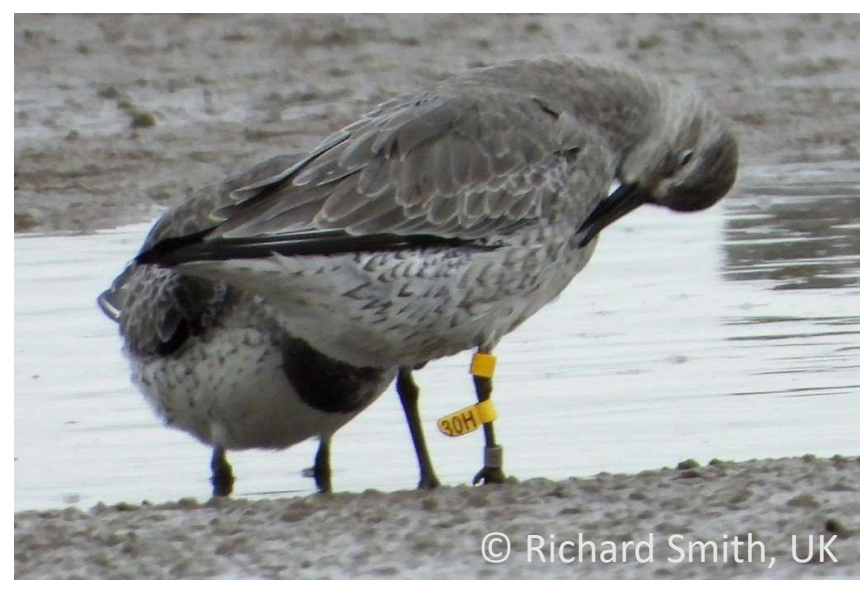
Y-Yf 30H, December 2020, Meols, Cheshire, UK