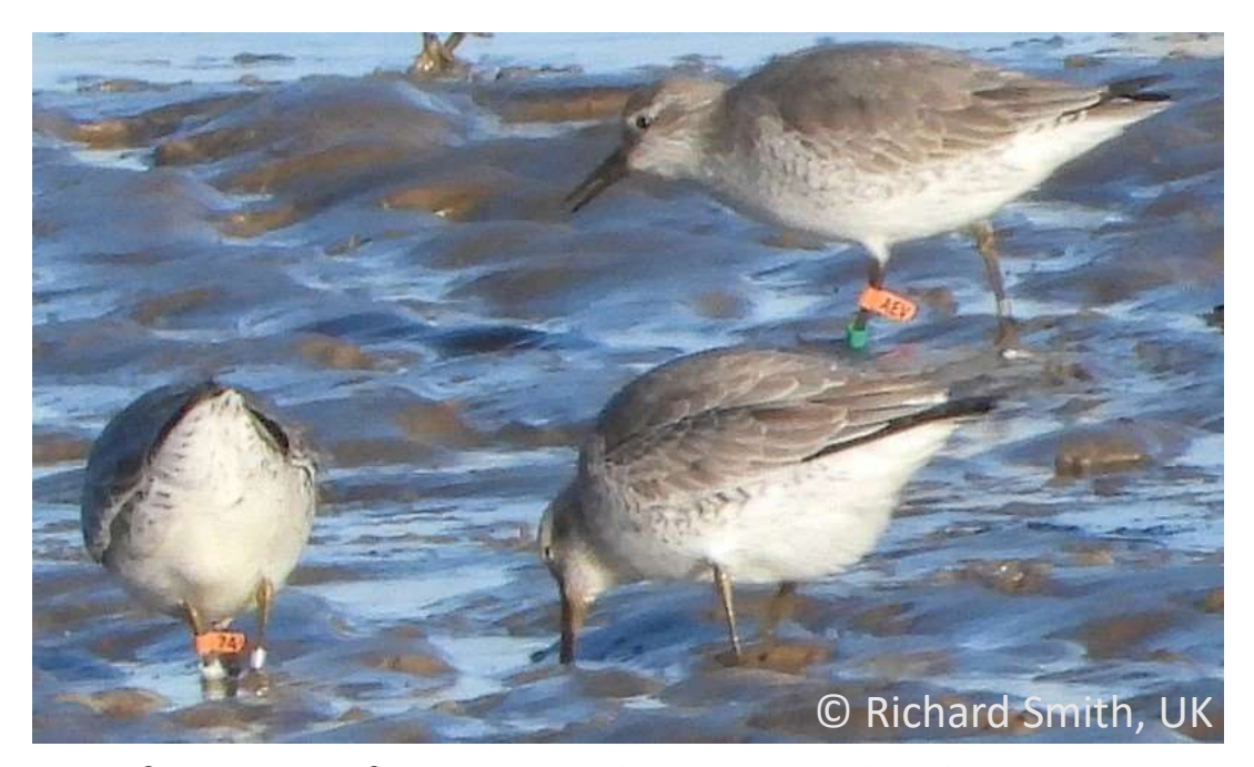
OfP 74 and OfG AEV, March 2020, Meols, Cheshire, UK