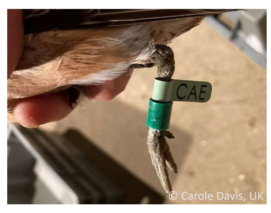
LfG CAE newly ringed, August 2020, The Wash, UK