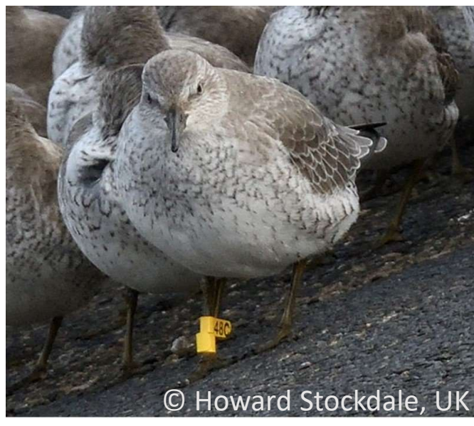
Yf-Y 48C, February 2020, Heysham, UK