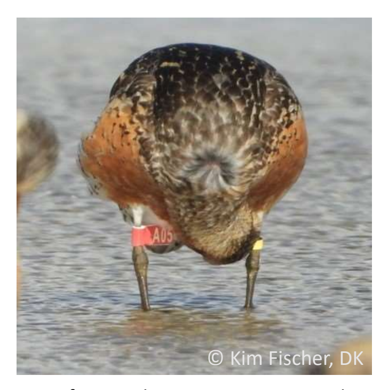
Y+Rf A05, July 2020, Fanø, Denmark