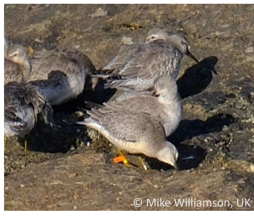
OfY HAL, September 2020, Aberlady Bay, Scotland