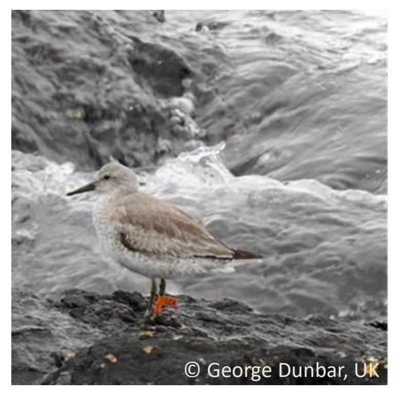
OfO LCA, May 2020, Bardsey Island, Wales