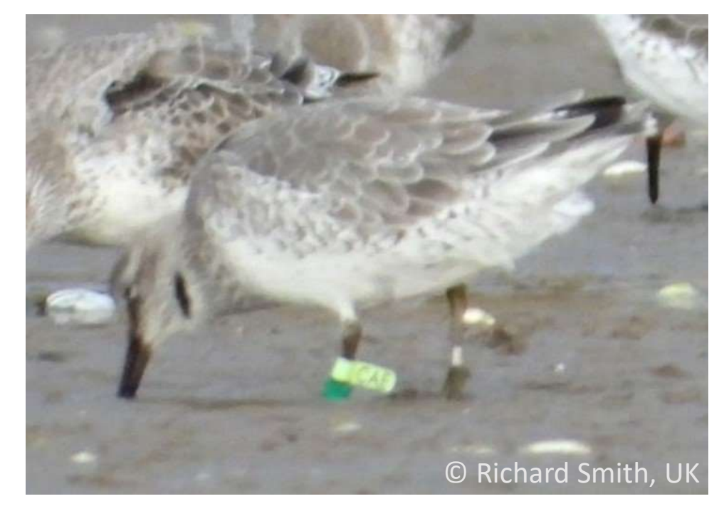
LfG CAE in the field, November 2020, Dee Estuary, Cheshire, UK