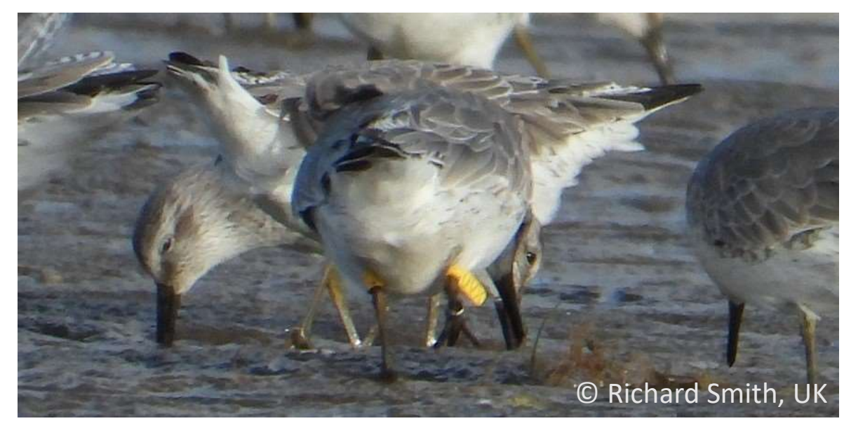
Yf UVX, November 2020, Dee Estuary, Cheshire, UK