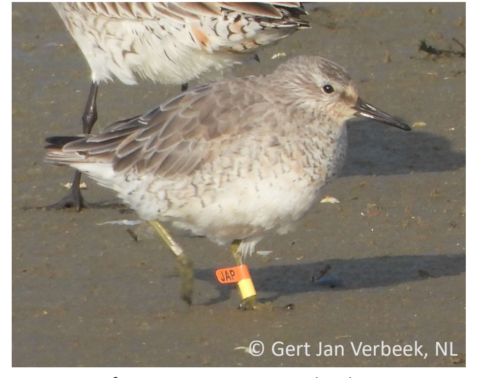
OfY JAP, June 2022, Ameland, NL