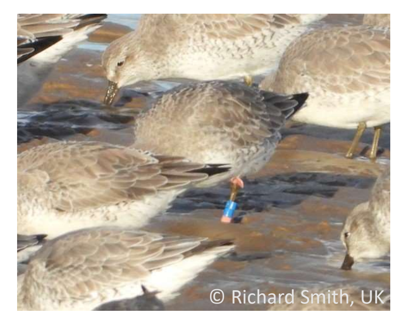
Rf-BBR, Dec 2020 Dee Estuary, Cheshire, UK