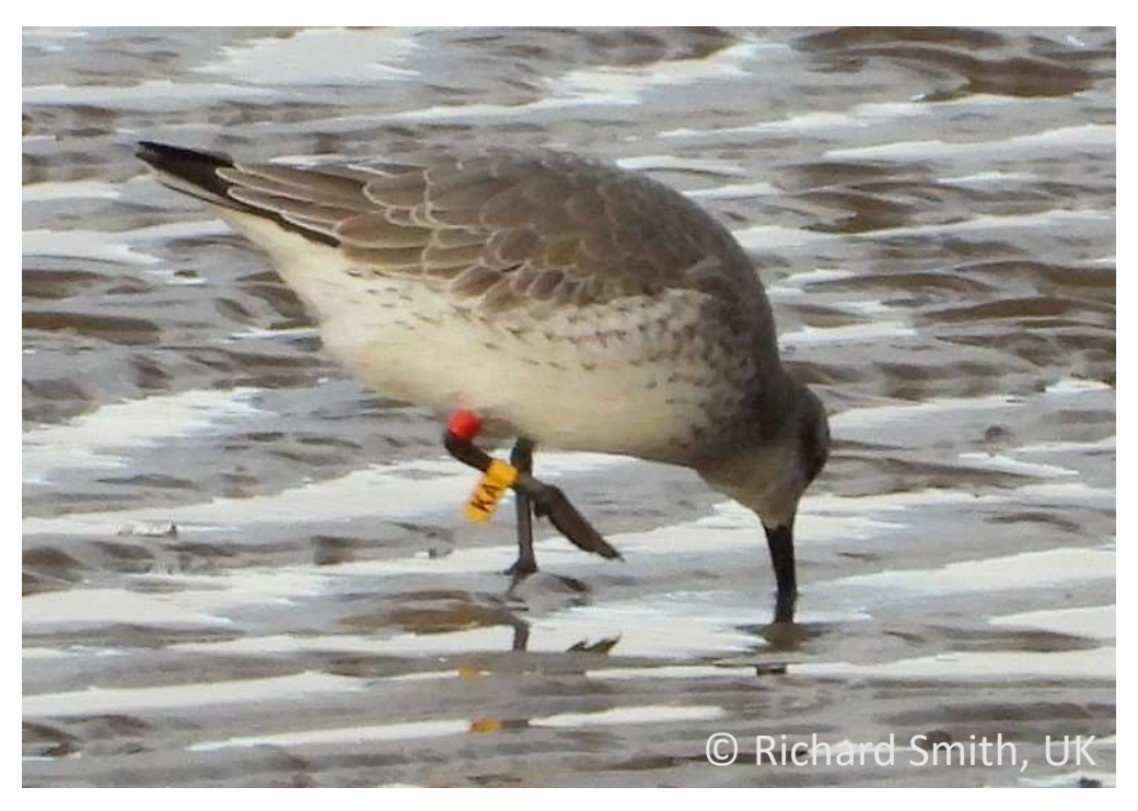
Yf KA, December 2020, Meols, Cheshire, UK