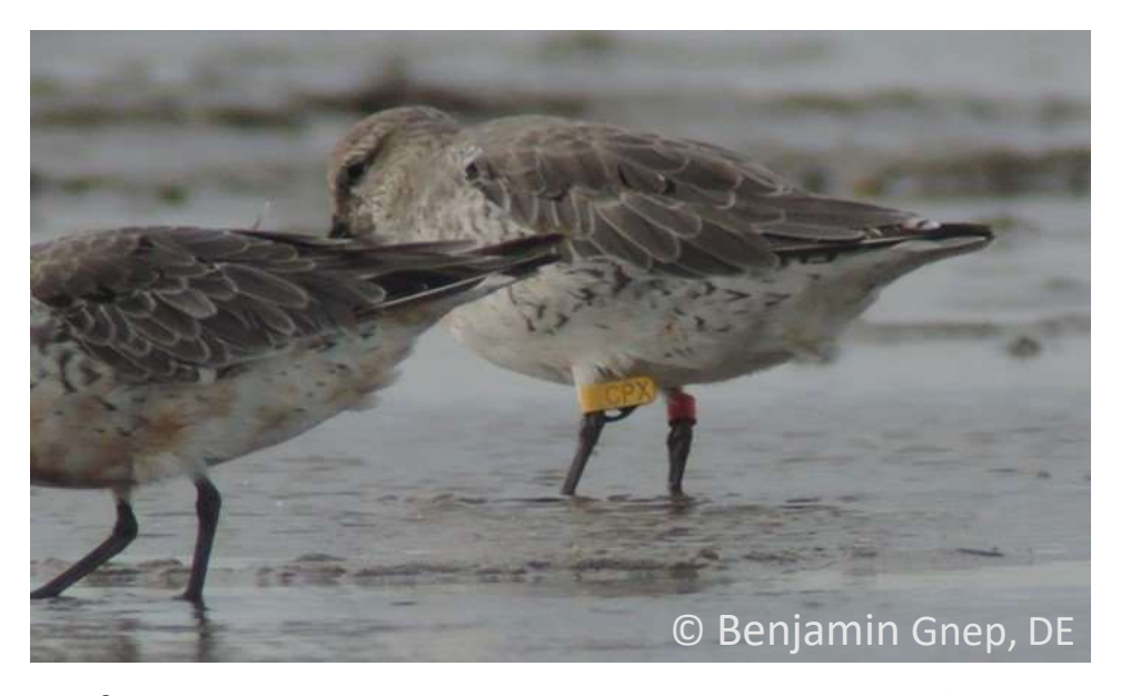
Yf CPX, September 2018, Griend, The Netherlands